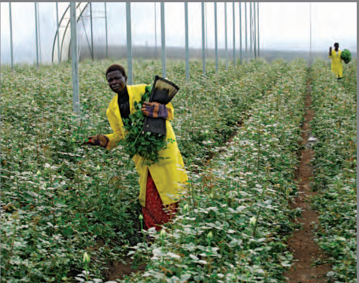
Kenyan flower worker harvesting flowers inside greenhouse.