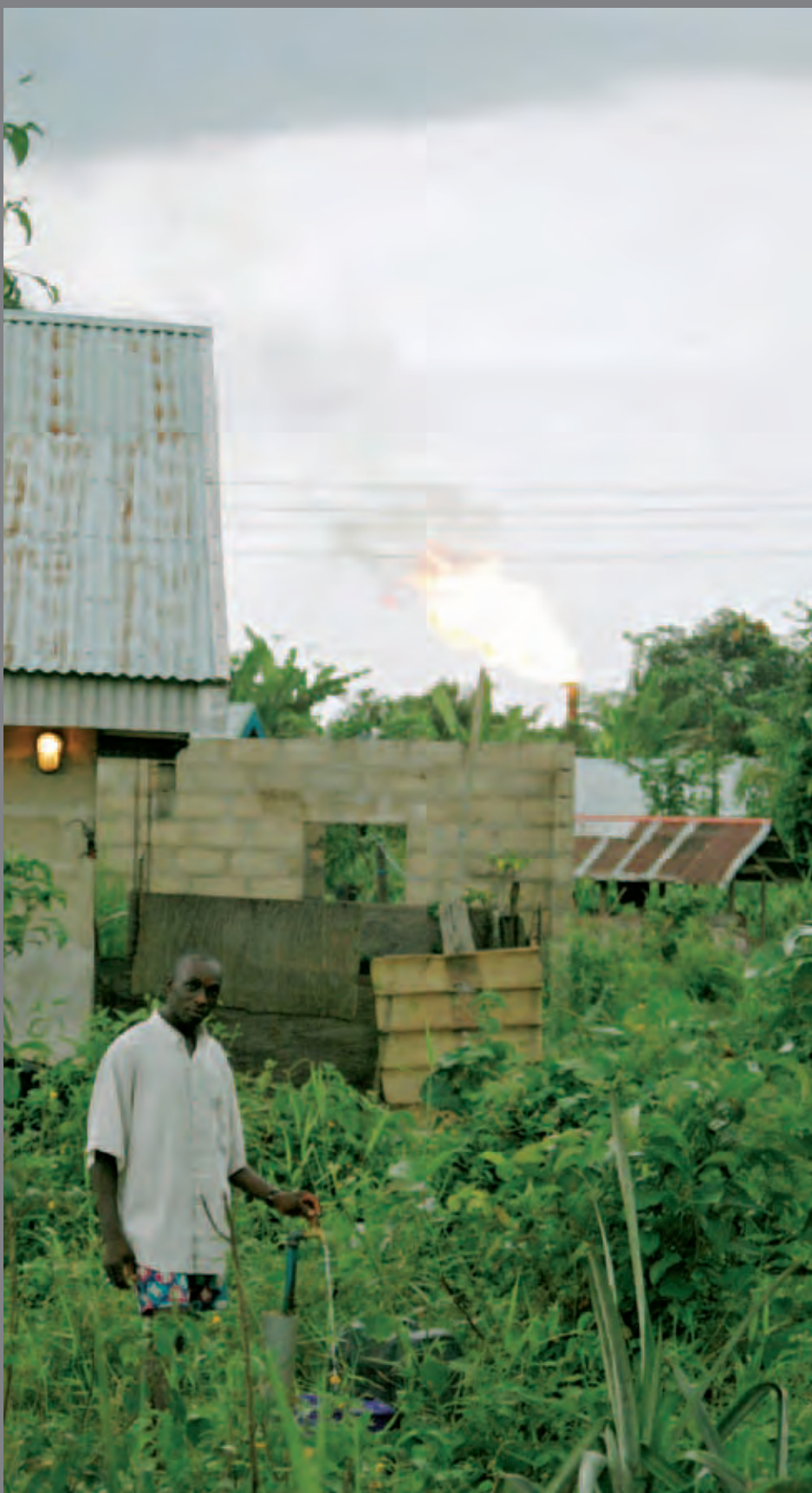
A man stands outside in a local neighbourhood with gas flaring in the background.