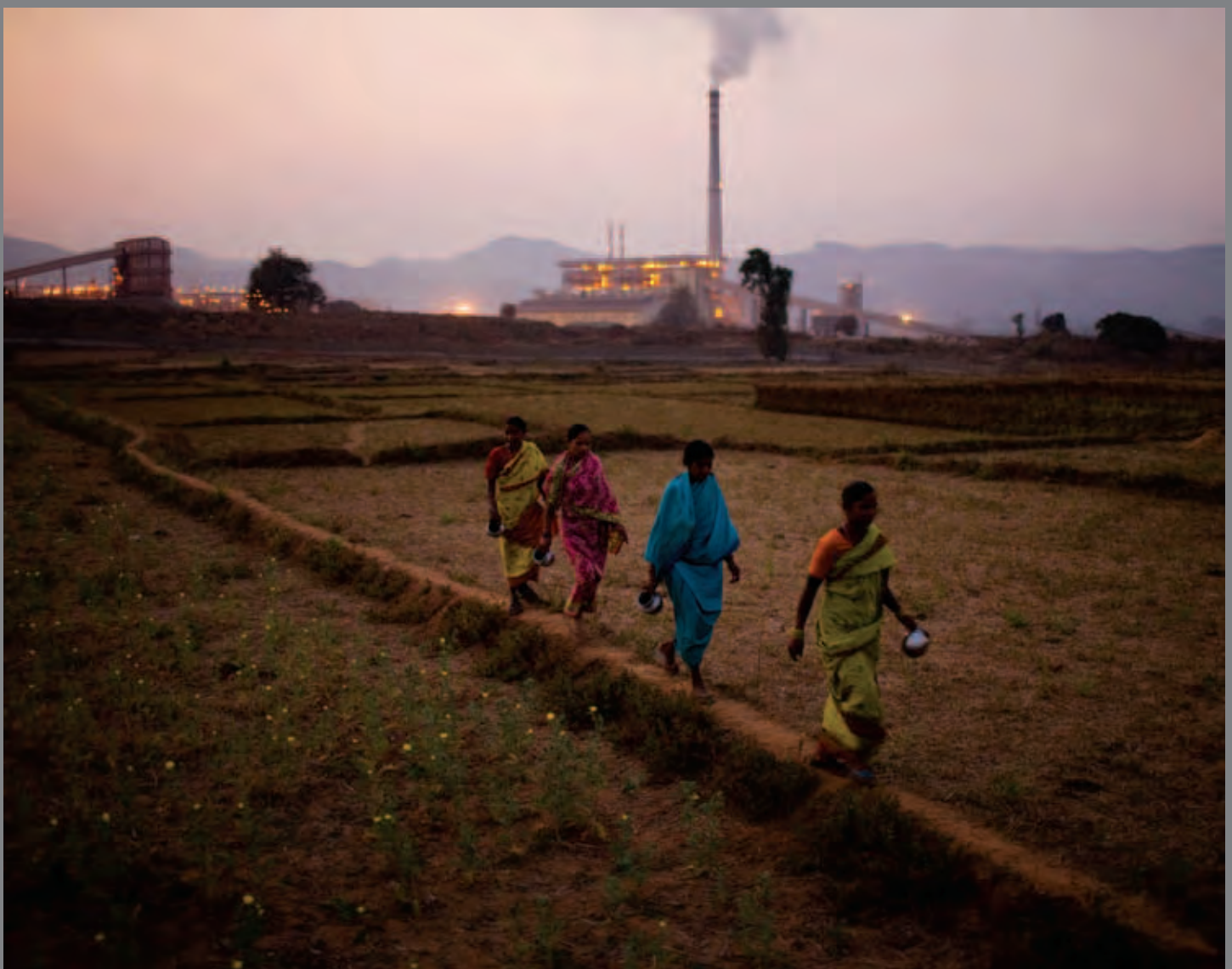
The Vedanta refinery in Lanjigarh, Orissa