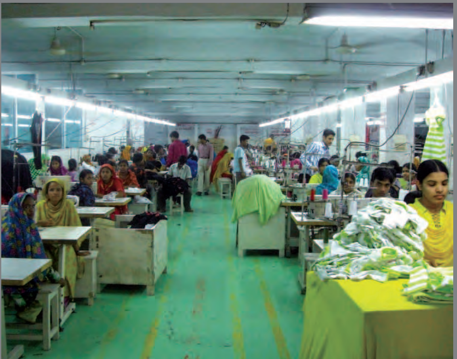
Bangladeshi garment workers in Dhaka garment factory.