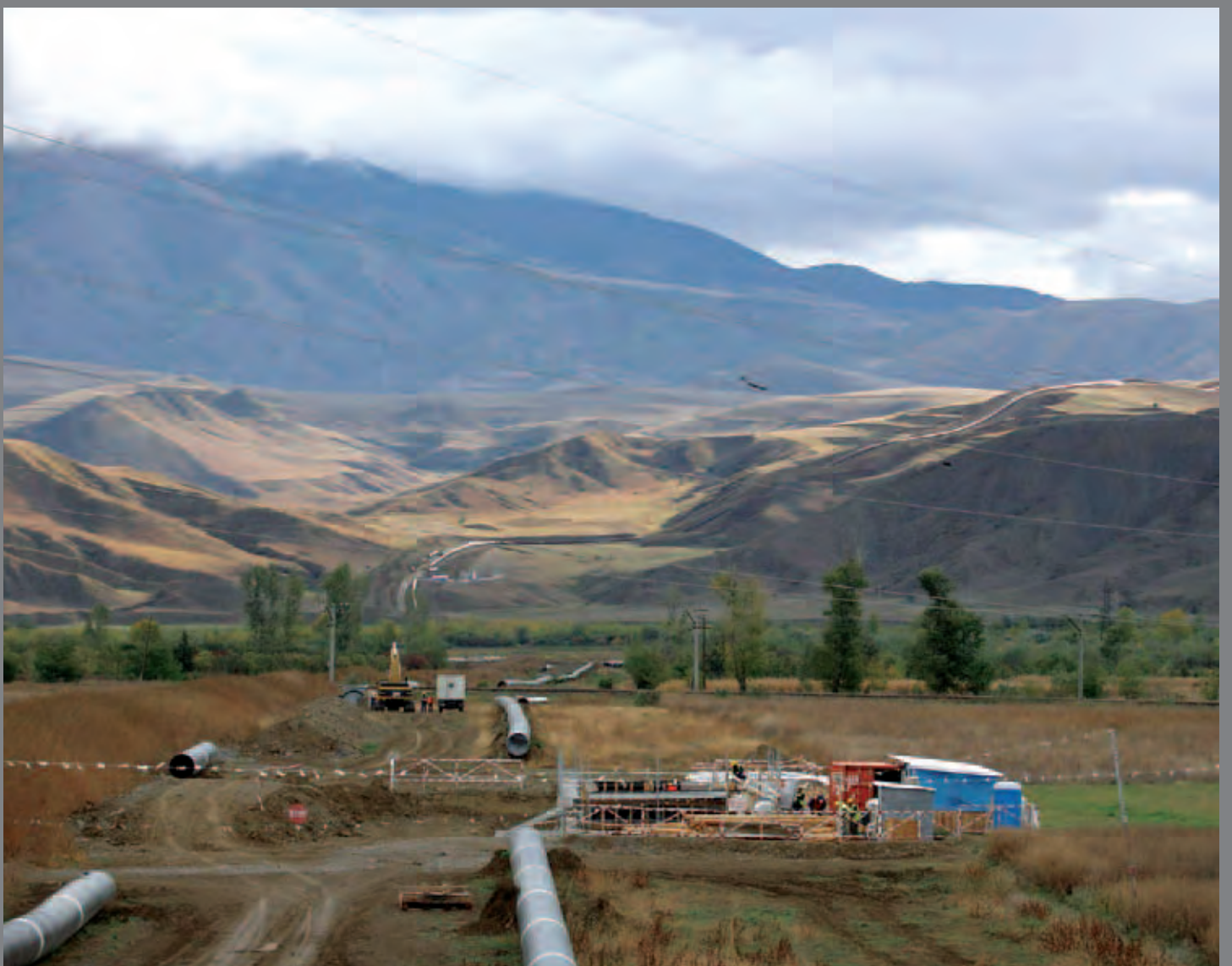
Construction of pipeline in Borjomi National Park.