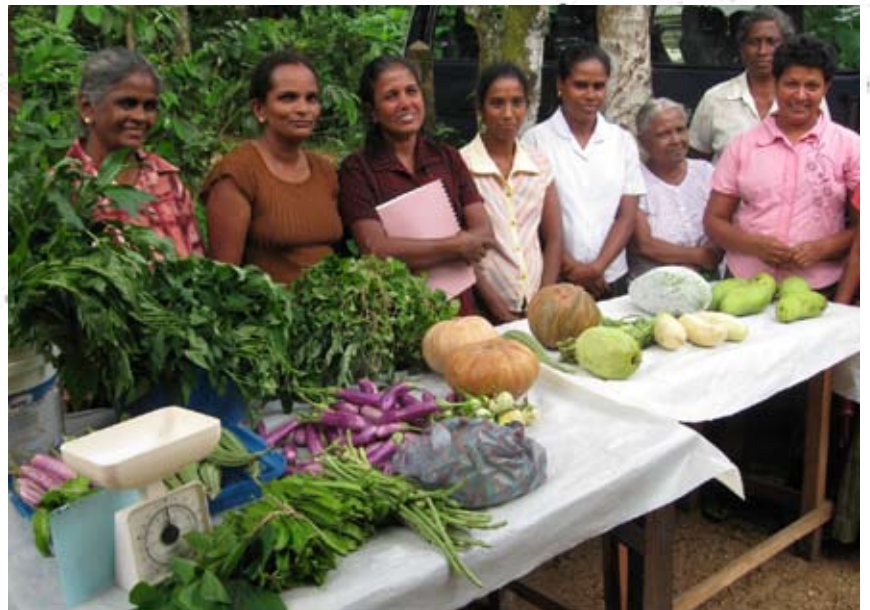
A Sri Lankan women's collective sells organic food as part of a community project run by Monlar, a War on Want partner organisation