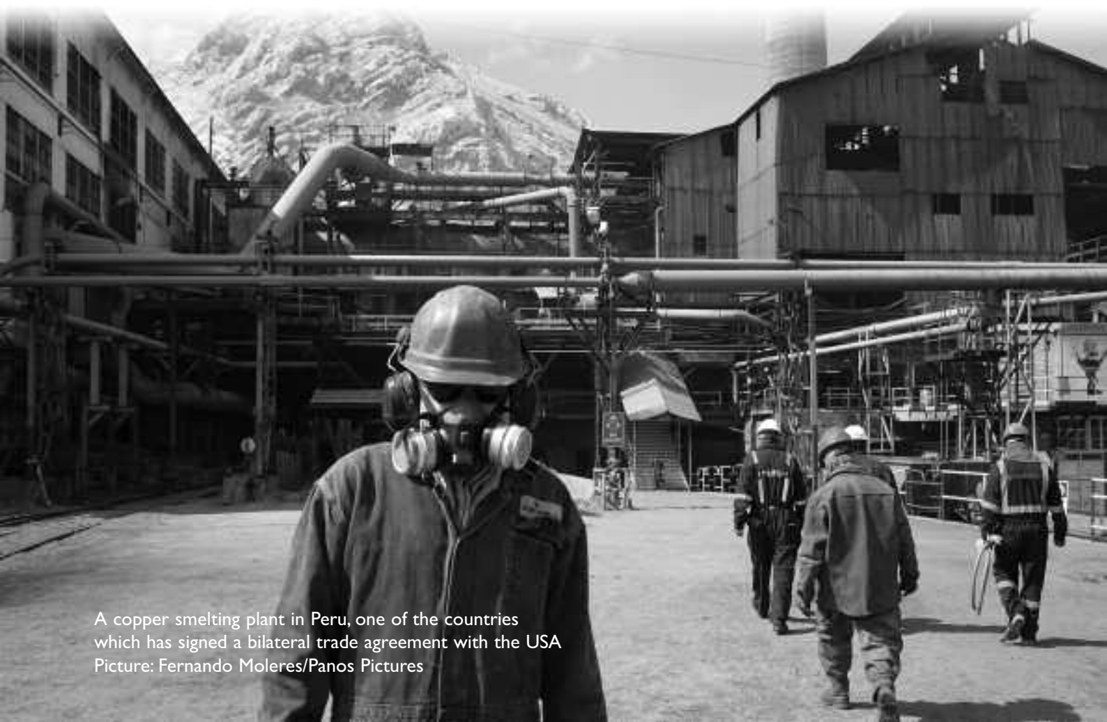
A copper smelting plant in Peru, one of the countries which has signed a bilateral trade agreement with the USA

Nonetheless, neoliberal globalisation continues to be resisted. In addition to the ascendance of politically left parties across the region, social movements continue to challenge the neoliberal paradigm with increasing strength. These movements include the Landless Workers’ Movement (MST) in Brazil, the Confederation of Indigenous Nationalities of Ecuador (CONAIE), the Zapatista movement in Mexico, the cocaleros and activists against water privatisation and gas pipeline investments