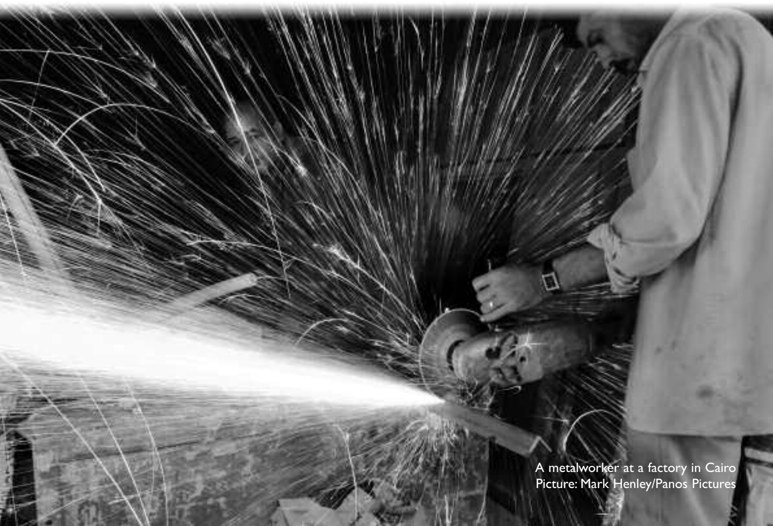
A metalworker at a factory in Cairo

Source: SIA-EMFTA Consortium, Sustainability Impacts of the Euro-Mediterranean Free Trade Area: Final Report on Phase 2 of the SIA-EMFTA Project , SIA-EMFTA Consortium, 2006