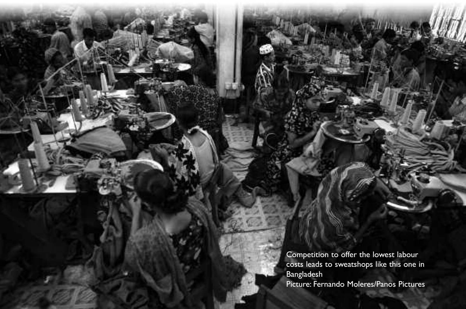
Competition to offer the lowest labour costs leads to sweatshops like this one in Bangladesh

could create serious difficulties for the capacity of developing countries to protect their industries, employment and the policy space for future industrial development, in total contradiction to the aspirations of a 'development round'. This would add pressure for low-wage competition between developing countries, with negative impacts on fundamental labour and environmental standards ... developing countries need to be able to sustain employment and to retain the policy space they need in order to be able to achieve development. 123