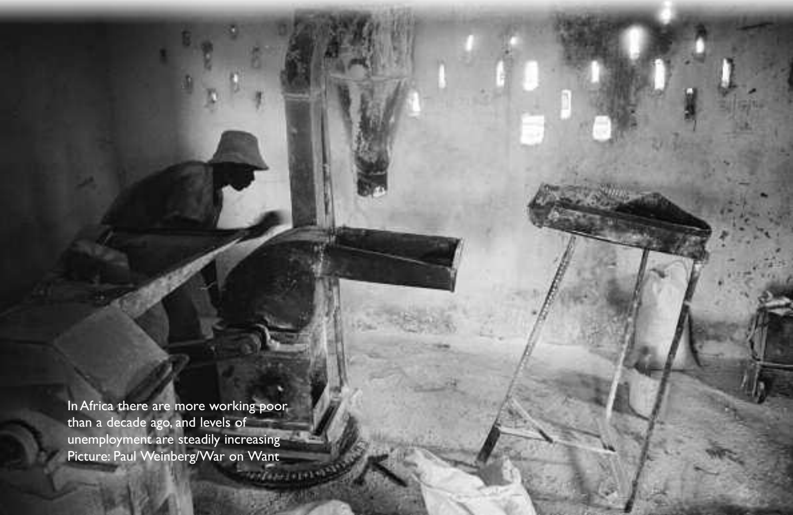
In Africa there are more working poor than a decade ago, and levels of unemployment are steadily increasing

In Morocco, broad-based trade liberalisation initiated in 1983 caused a reduction in employment of nearly 6% in export-oriented firms, 8.9% in the beverages and tobacco sector, 4.3%