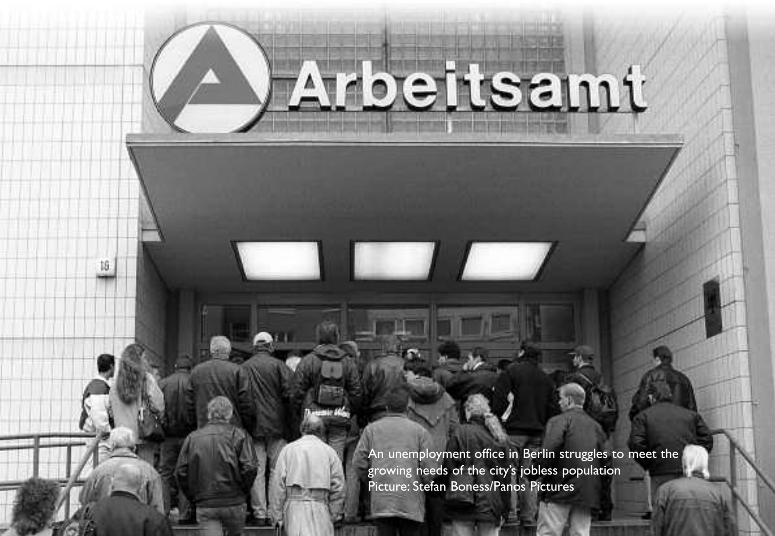
An unemployment office in Berlin struggles to meet the growing needs of the city's jobless population

In the OECD countries generally, globalisation increases opportunities for companies to shift production overseas and thus increases their bargaining power over their workforces, in most of the manufacturing sector and in business services. 105 According to the IMF, the quadrupling of the number of workers competing in the global market since 1980 has led to more finished goods being imported into the OECD and more offshoring of intermediate goods production, decreasing labour's share of GDP in industrialised economies. 106 Similarly, the OECD's own analysis shows that "foreign competition reduces employment in the most exposed industries" in its 30 member countries. 107 Combined with the current downturn in global demand, this is already leading to huge job losses in industrialised countries: by 2010, the OECD predicts unemployment in its member countries to increase by over eight million, to 42.1 million. 108