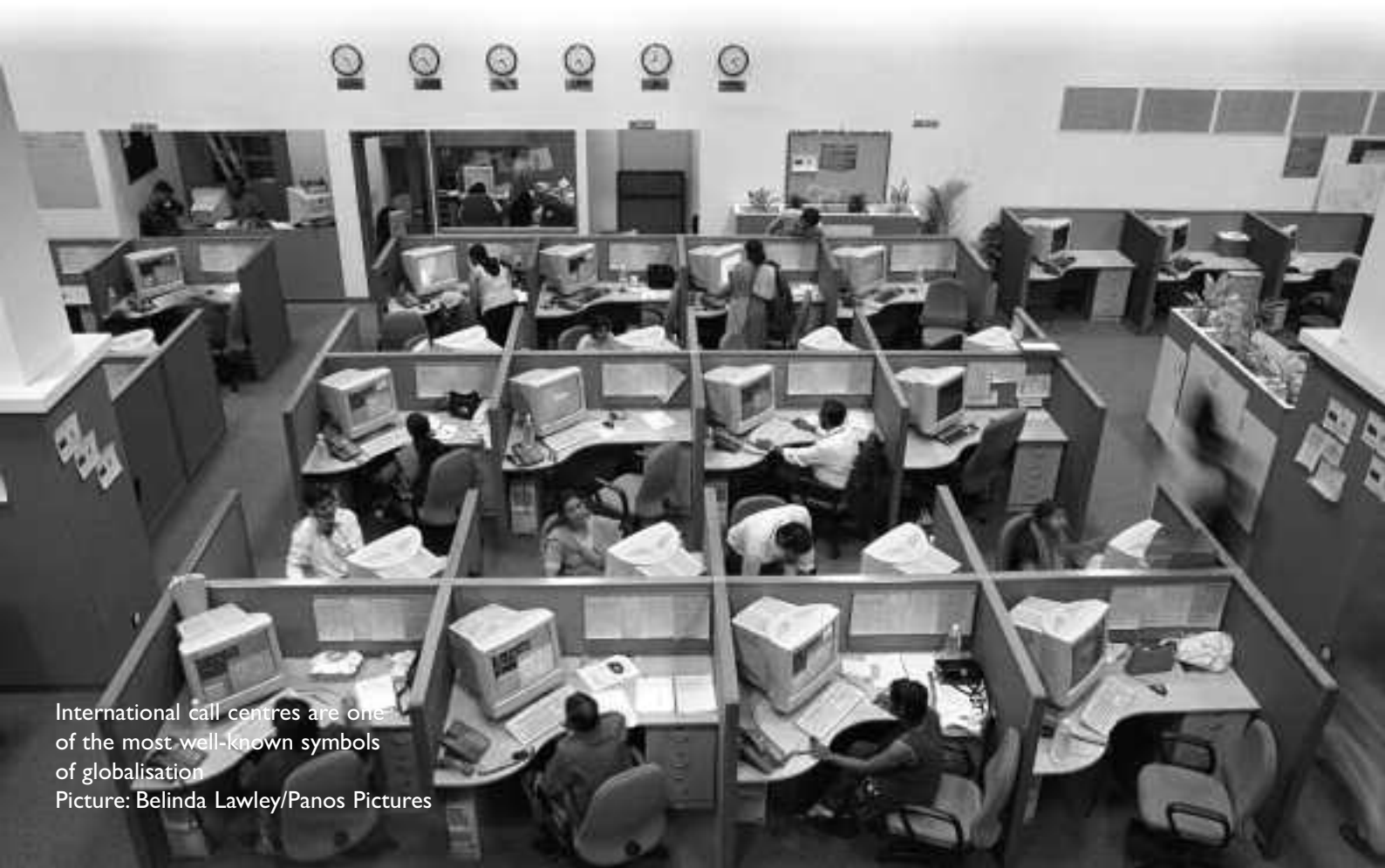
International call centres are one of the most well-known symbols of globalisation

As the EU seeks to subordinate its labour laws to the interests of large companies, it can be expected that basic rights to bargain collectively, to strike and even to unionise will continue to be eroded unless trade unions reassert them vigorously. In addition, many thousands of workers, particularly women workers from the new member states of Central and Eastern Europe, are already stuck in precarious work, with low wages and conditions and often without contracts. This number will be boosted as European companies seek to create the most flexible workforce possible in preference to organised labour. The rest of the chapter looks at how free trade policies will undermine the security and availability of work in Europe.