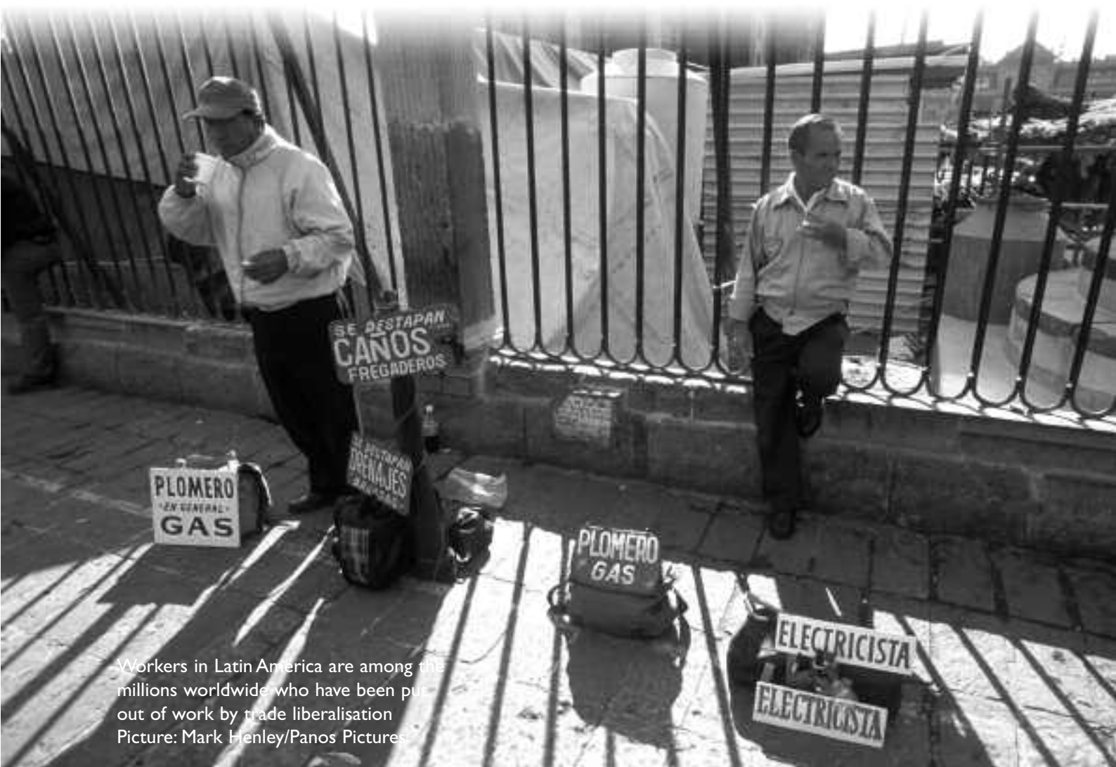
Workers in Latin America are among the millions worldwide who have been put out of work by trade liberalisation

Free market economists have commonly argued that liberalising (opening up) economies and removing barriers to the free flow of goods and services is the key to achieving economic growth, and that this in turn is a prerequisite for attempts to tackle poverty and to create jobs. Yet 30 years of this liberalisation have failed to create enough employment, nor even the growth