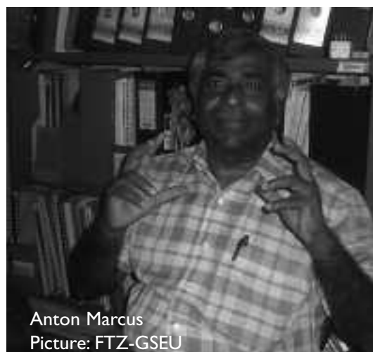
Anton Marcus Picture: FTZ-GSEU

War on Want works with the FTZ-GSEU in Sri Lanka, a trade union which has over 14,000 members and is affiliated to the ITUC and ITGLWF. The majority of its members are female garment workers working in sweatshop conditions in ‘free trade zones’ in Colombo. These women suffer routine abuses such as dismissal without notice, lack of safety equipment or chairs, and sometimes physical and sexual abuse. FTZ-GSEU concentrates on training, education, awareness raising and exchanges to help workers defend their rights, including how to defend people with complaints and how to appear at tribunals.