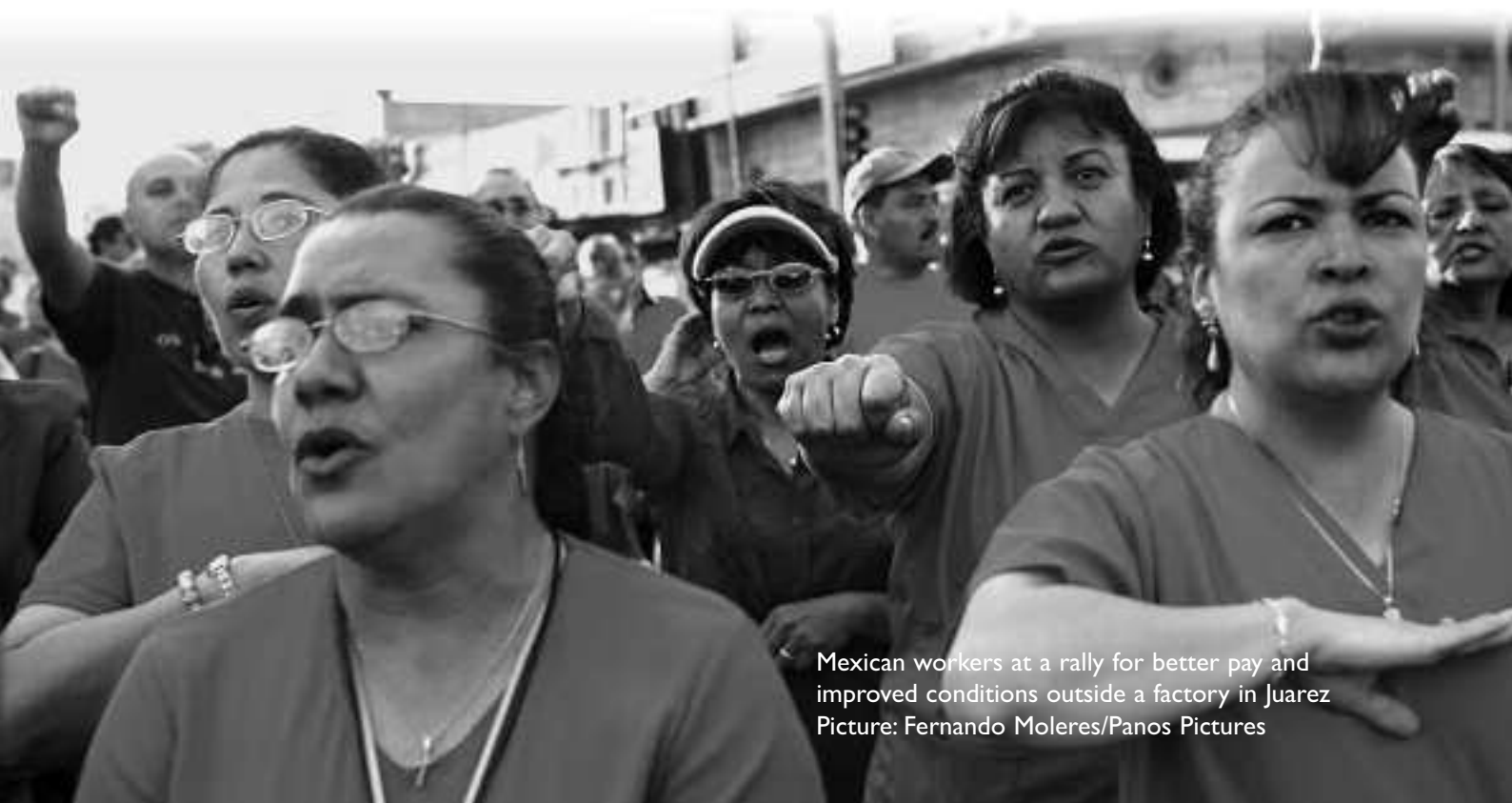
Mexican workers at a rally for better pay and improved conditions outside a factory in Juarez

The rest of the manufacturing sector fared even worse. In non-maquila manufacturing, both employment and wages have fallen. Employment growth collapsed from nearly 4% per year pre-liberalisation to a loss of 1% per year from 1981-2000, with 140,000 job losses between January 1994 and June 2006. Nominal wage growth dropped from 2.4% per year to just 0.1% per year. In real terms, the average wage for blue-collar workers halved in value between 1981 and 1999. The minimum wage totally collapsed in real terms after liberalisation, dropping to just one fifth of its 1976 value by 2000. 74