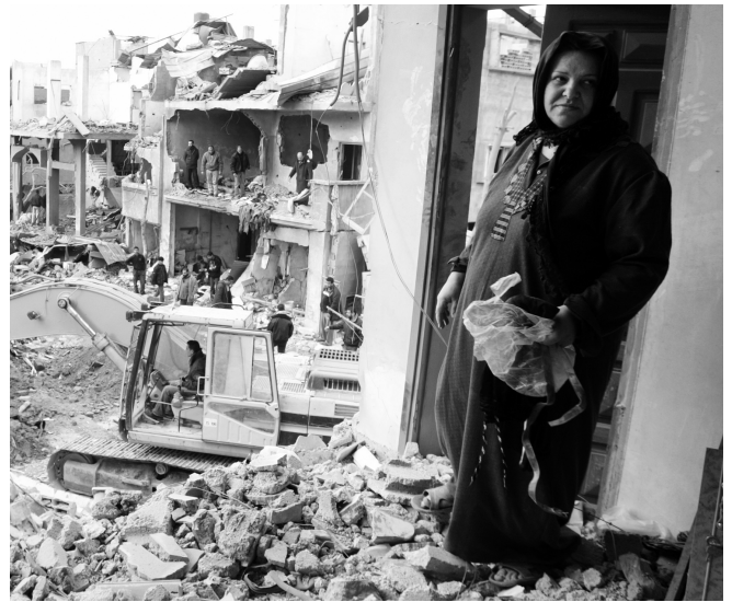
A Palestinian woman surveys her destroyed house after an Israeli air strike in Jabalya on 2 January 2009.

Israel’s occupation of Palestinian territory provides a central focus of tension in Middle East politics. Since the outbreak of the second intifada in September 2000 Israel has intensified its military action against Palestinians living under the occupation, leading to a human rights and humanitarian crisis. As a result of the occupation, 70% Palestinians are now living in acute poverty and over half are dependent on food aid.