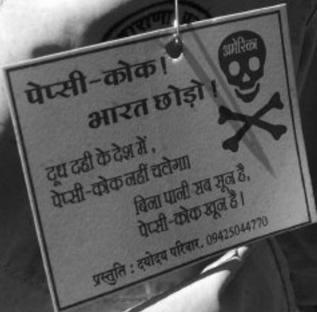
School children join hands at a protest against Coca-Cola contaminating water

To make matters worse for Coca-Cola, when it launched its 'purified tap water' drink Dasani one month later in the UK, illegal levels of carcinogenic bromates were discovered. The company had to recall 500,000 bottles and abandon the drink's launch. 10