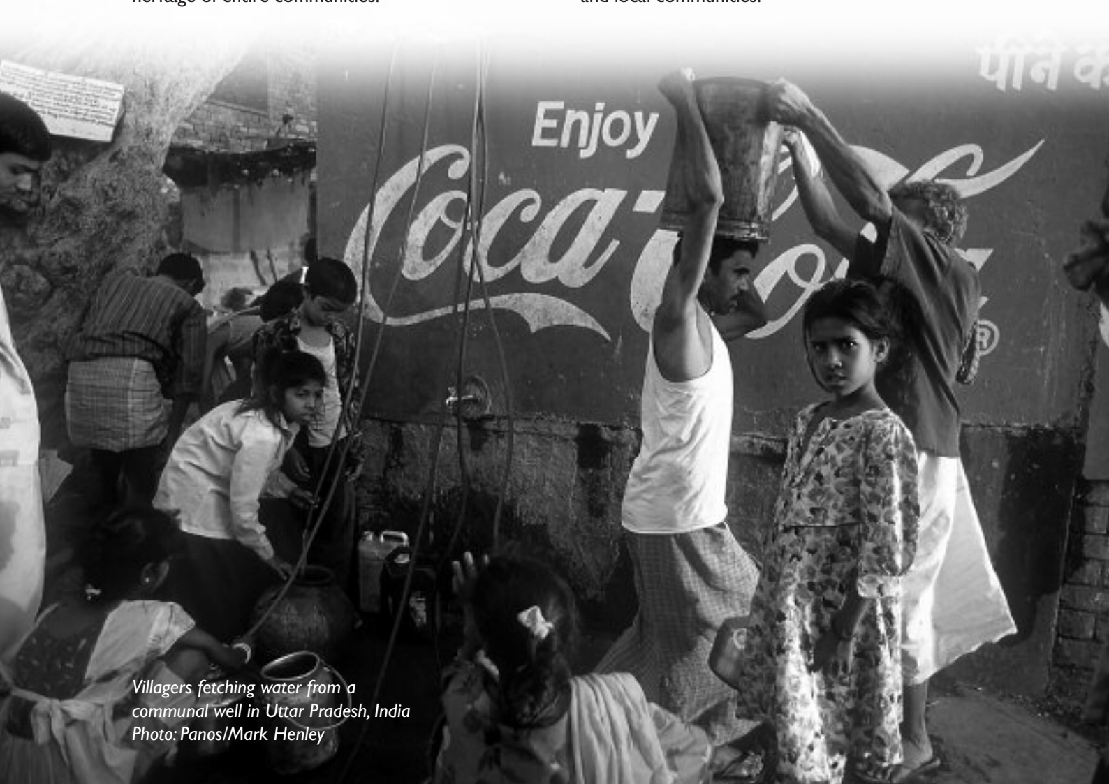
Villagers fetching water from a communal well in Uttar Pradesh, India

Coca-Cola’s operations have particularly been blamed for exacerbating water shortages in regions that suffer from a lack of water resources and rainfall. Nowhere has this been better documented than in India, where there are now community campaigns against the company in several states. New research carried out by War on Want for this report in the Indian states of Rajasthan and Uttar Pradesh affirms the findings from Kerala and Maharashtra that Coca-Cola’s activities are having a serious negative impact on farmers and local communities.