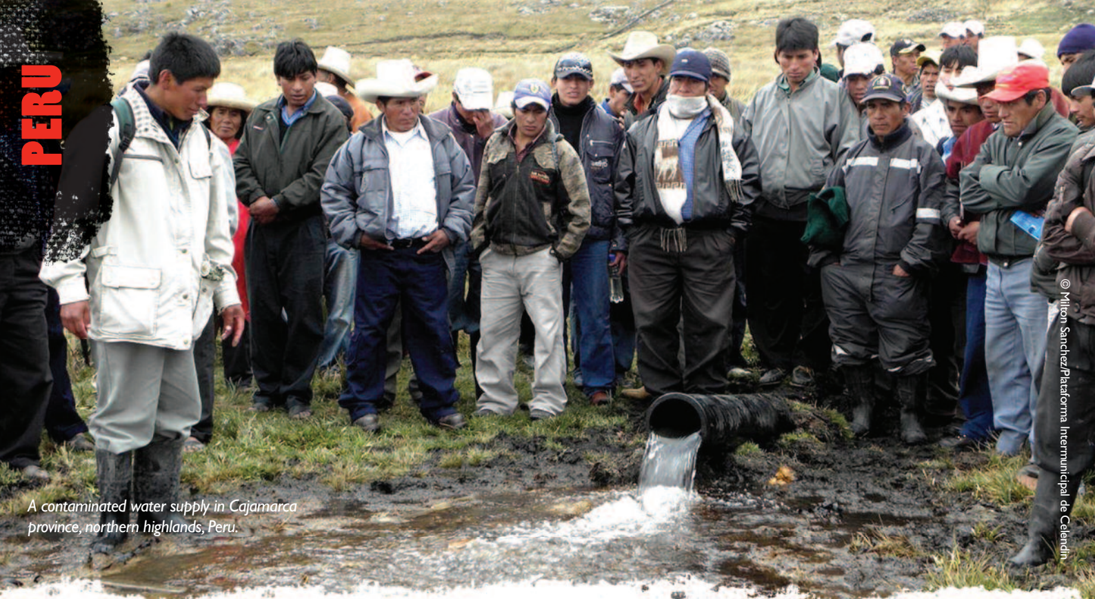
A contaminated water supply in Cajamarca province, northern highlands, Peru.