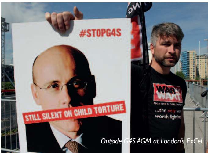
Outside G4S AGM at London's ExCel

Many BDS targets have been chosen through campaigners working together with Palestinians living directly under Israeli Occupation. After all, who is better placed to determine campaign priorities than the people most directly affected? Take the Stop G4S campaign, focusing on the British security company providing services and equipment to Israeli prisons. The call to target G4S came from Palestinian prisoner organisations on the eve of a massive hunger strike waged by Palestinian political prisoners. It was taken up by campaigners in countries around the world. The campaign has cost G4S billions of pounds in lost contracts, and even forced the Bill and Melinda Gates Foundation to divest its stake in G4S.